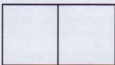
Cut short - standard

Rectangles - some spas are rectangular, i.e. the length and breadth are not equal. In this case the join or hinge can go one of two ways. If you require other than standard please let us know on your measuring sheet.